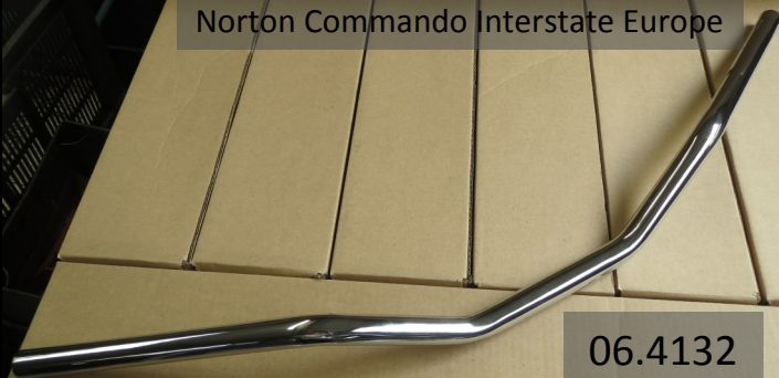
Norton Commando Interstate Europe