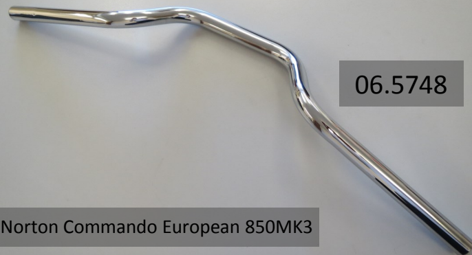
Norton Commando European 850MK3