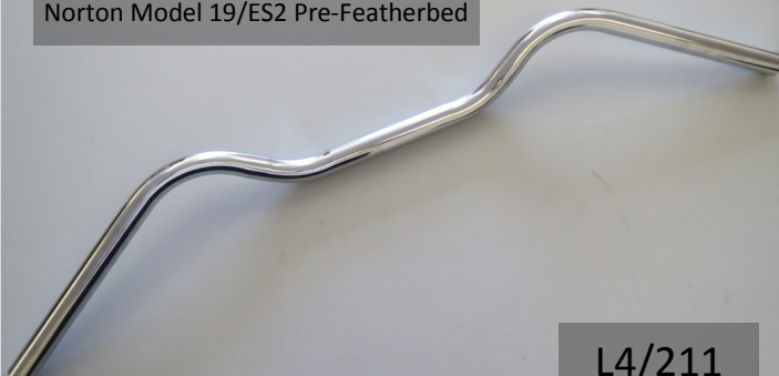
Norton Model 19/ES2 Pre-Featherbed